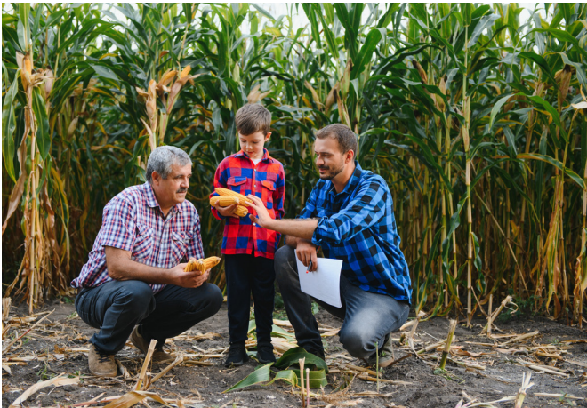
Figure 1. Involving family members in farm decision-making can better prepare the next generation to actively contribute to the farm's viability.

Families who don't communicate may be in denial that conflict exists or may be stalling because they lack information or resources needed to address conflict. Refraining to communicate may also be a coping method for people who prefer to avoid family conflict, struggle with the financial implications of farm transfer or fear giving up control. 2