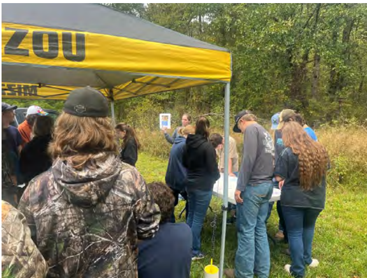
Bug Bingo with high school students to learn insect identification, pests vs. beneficial insects.