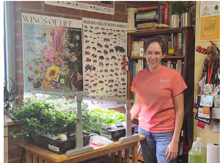
Desk top hydroponic units in my office, growing tomatoes, lettuce, kale, and bok choy. Hands-on learning about hydroponics allows me to better help clients.